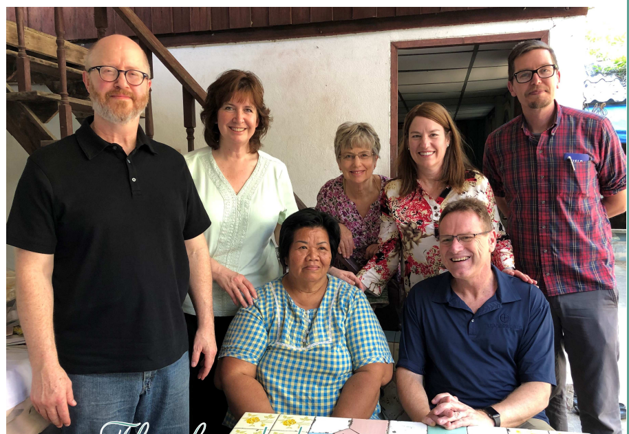
Thailand discernment team